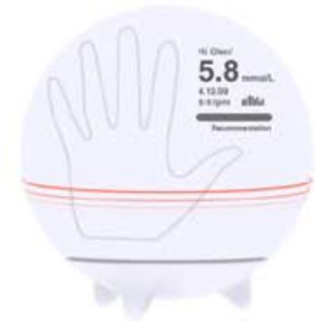
Figure 2.1 - Phase 1 Sculptural Execution - Scanning