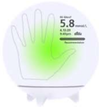
Figure 2.0 - Phase 1 Sculptural Execution - Diagnosis